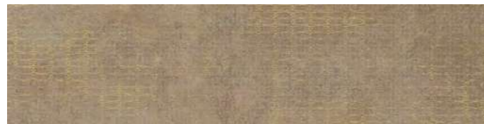
Aria Oxidum Decor