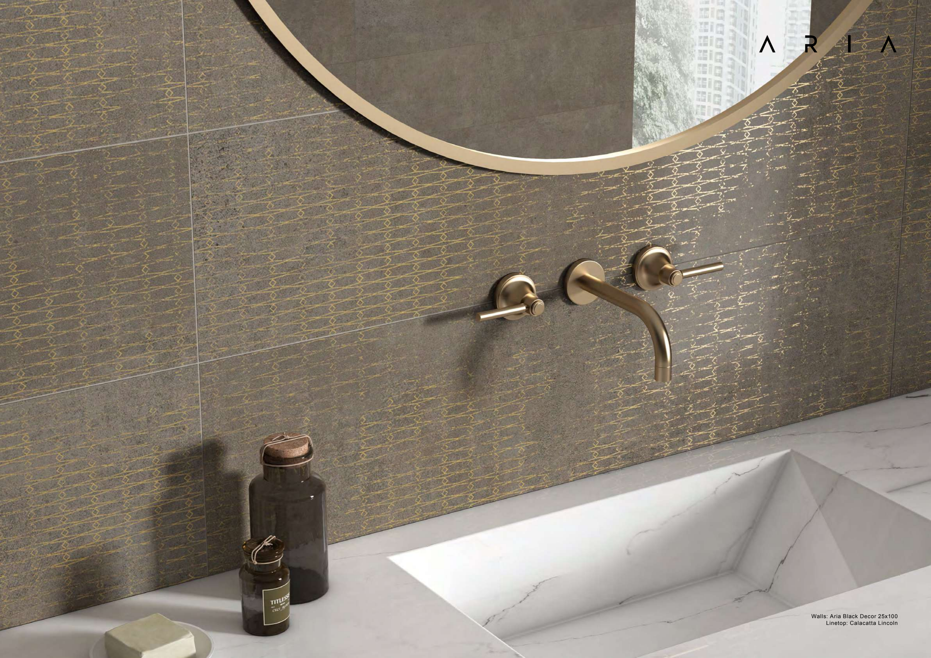
Walls: Aria Black Decor 25x100 Linetop: Calacatta Lincoln