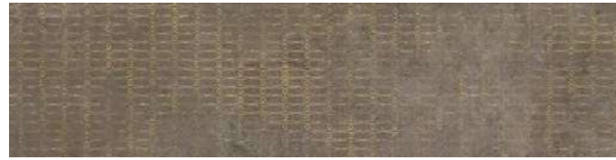
Aria Black Decor