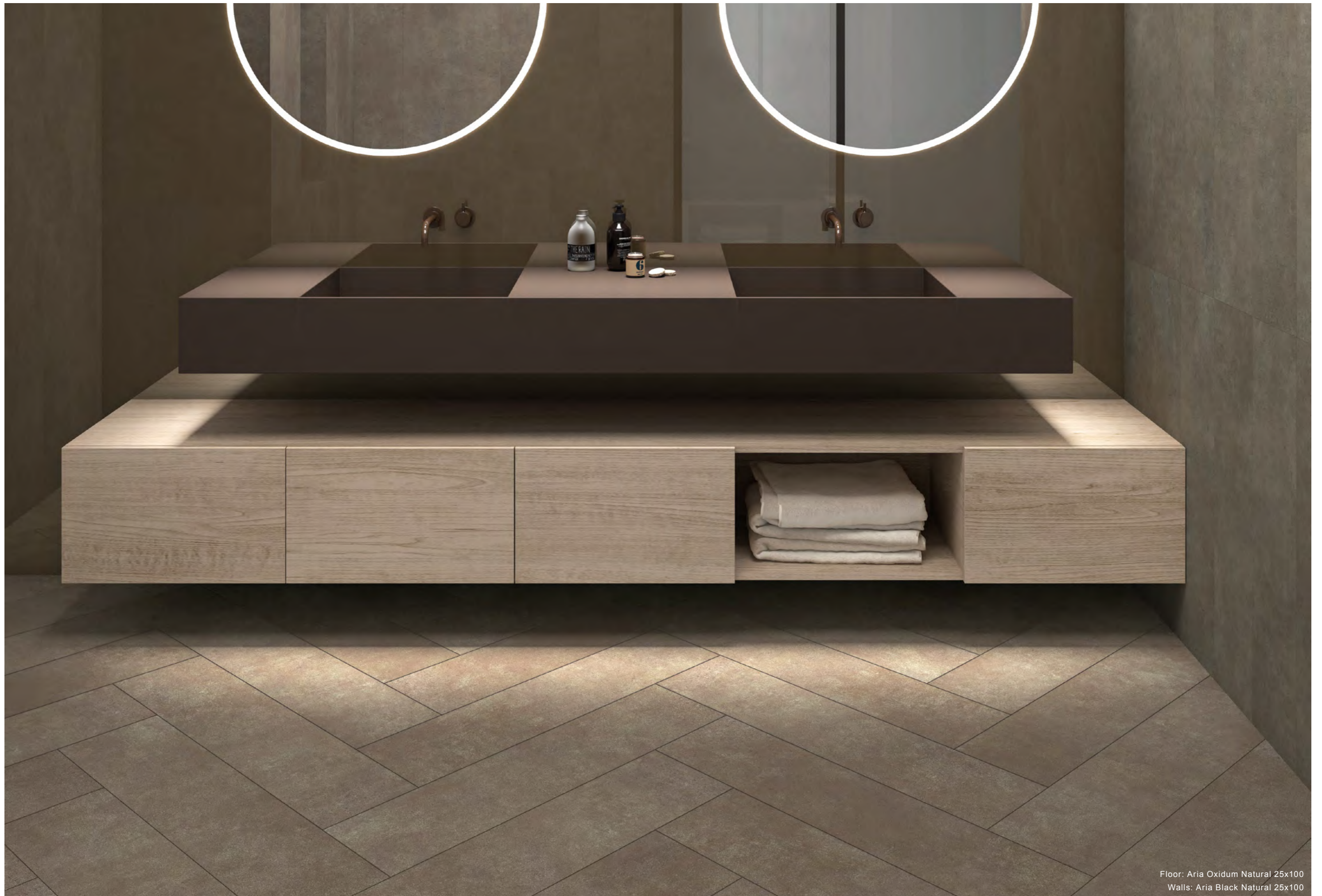
Floor: Aria Oxidum Natural 25x100 Walls: Aria Black Natural 25x100